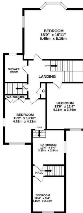
1ST FLOOR 971 sq.ft. (90.2 sq.m.) approx.